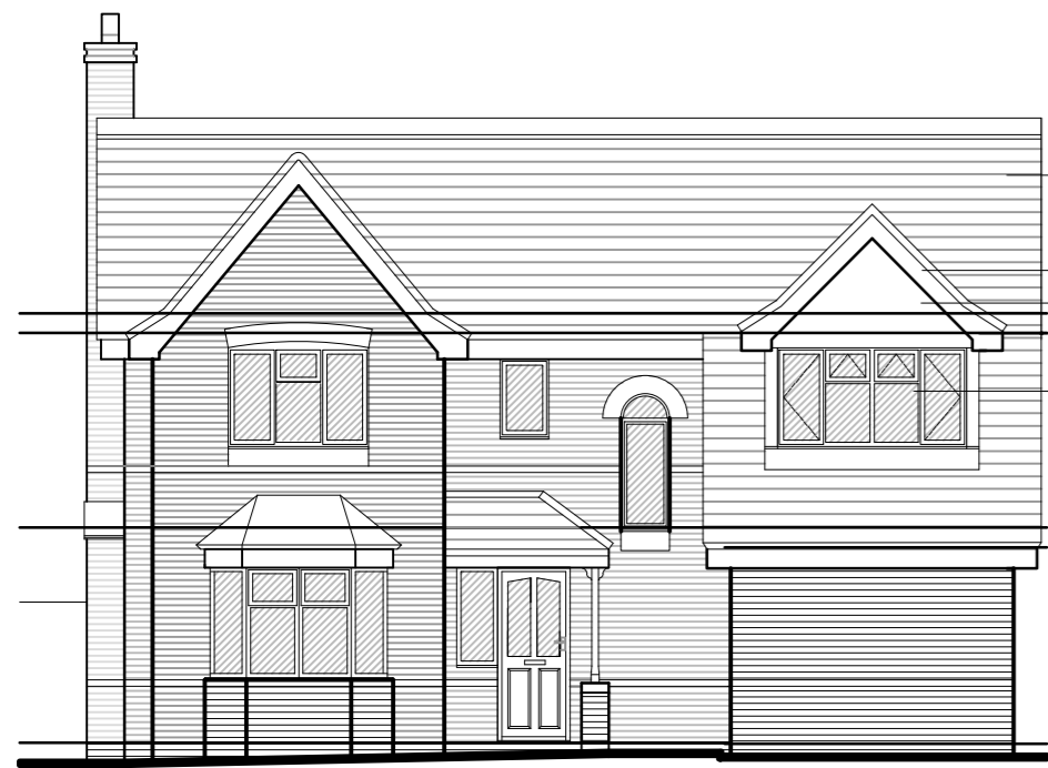
Proposed Front Elevation Scale. 1:100