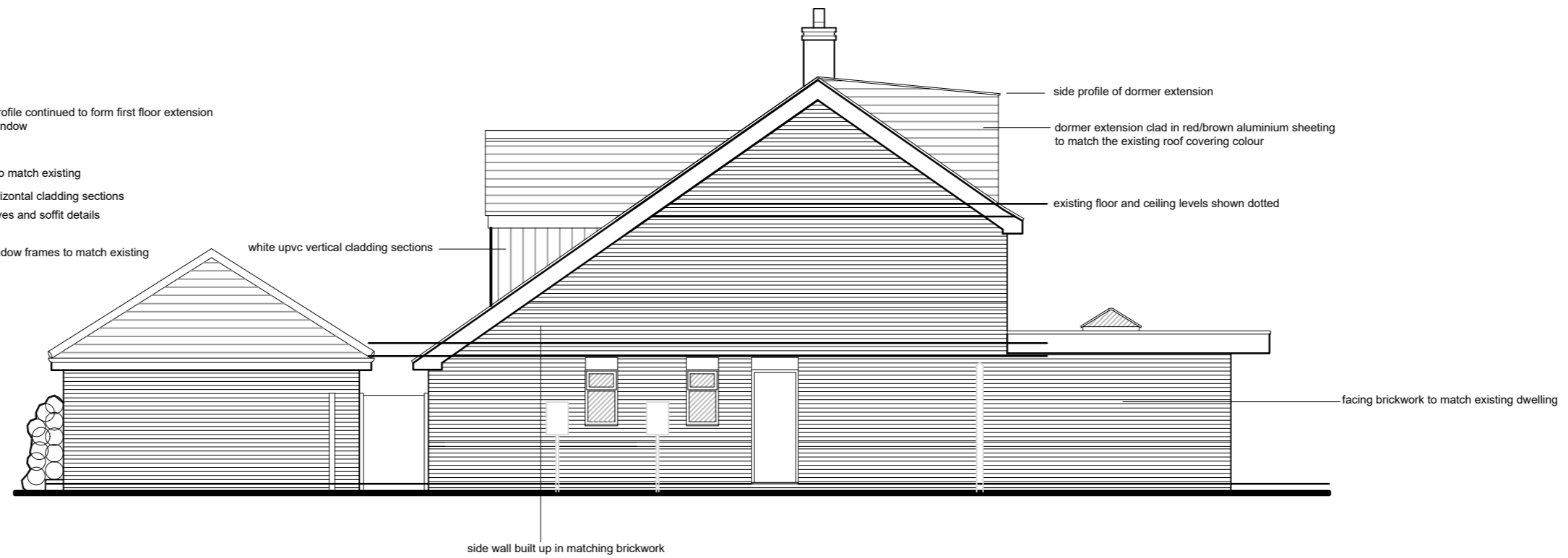
Proposed Side Elevation Scale. 1:100